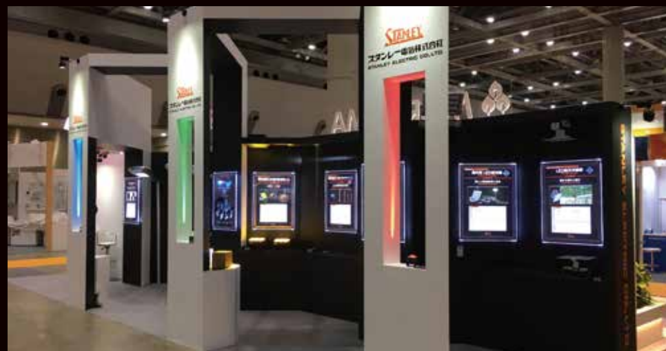
Stanley's booth at LIGHTING FAIR